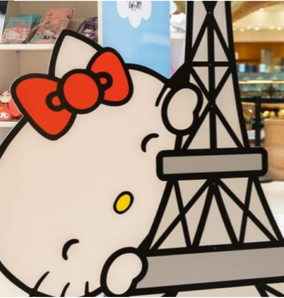
HELLO KITTY TOUR