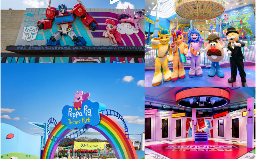
MONOPOLY LIFESIZED/ HASBRO CITY/ GALAXYLAND