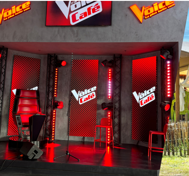
THE VOICE CAFÉ