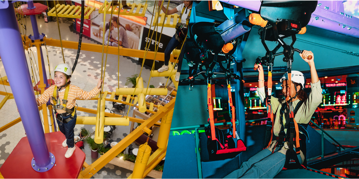
ROLLGLIDER AND ROPES COURSE IN EL EDEN SHOPPING CENTER, COLOMBIA