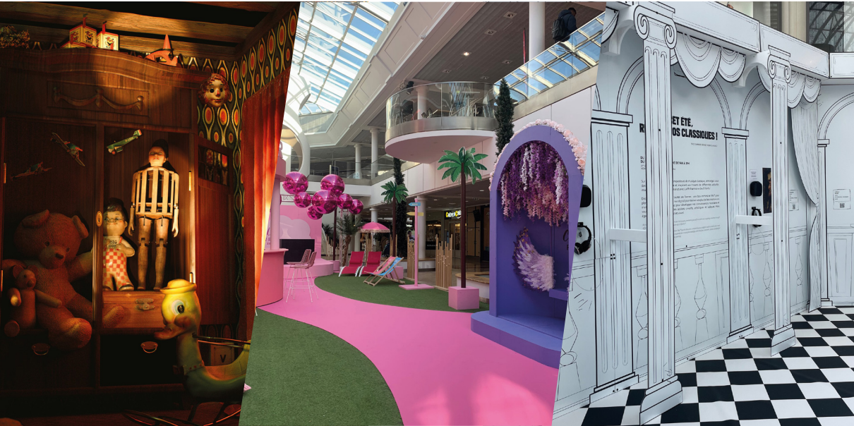
HELL HOUSE IN MARSEILLE