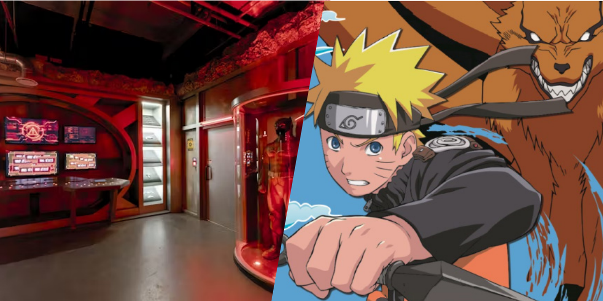
BATMAN ESCAPE IN PARIS