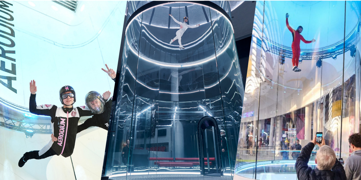
SMASH AIR SOUTH KOREA