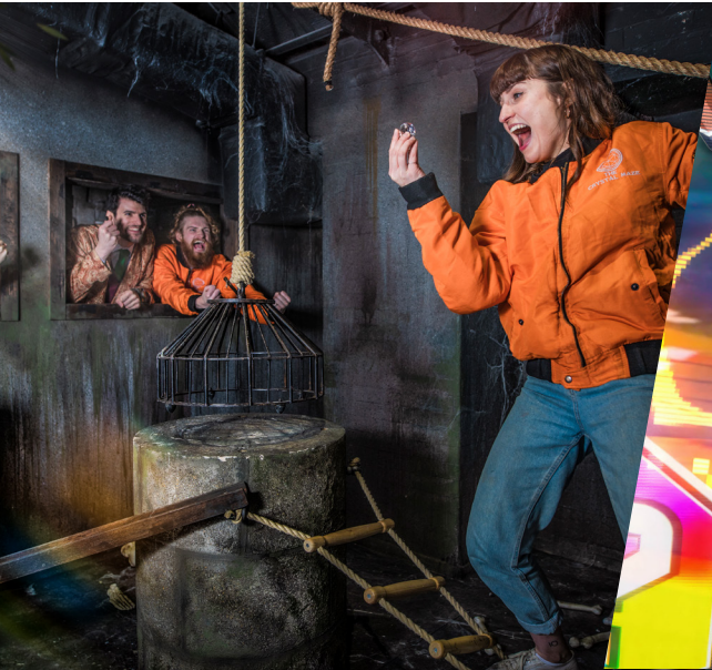
THE CRYSTAL MAZE LIVE EXPERIENCE