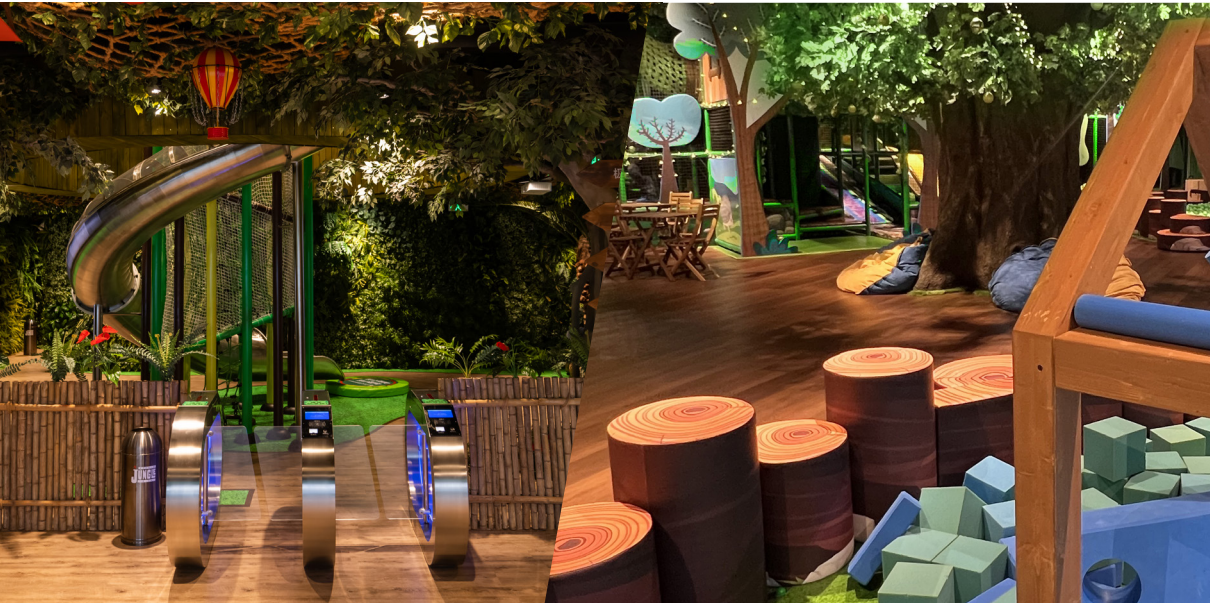
JUNGLE ENTERTAINMENT FEC'S CHAIN FOR "FLORENTIA VILLAGE LUXURY DESIGNER OUTLET" IN CHINA