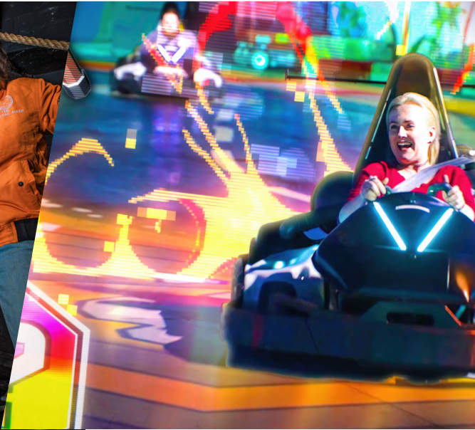
THE GAMES ARENA