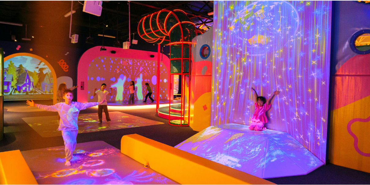
HELLO PARK DUBAI, UAE