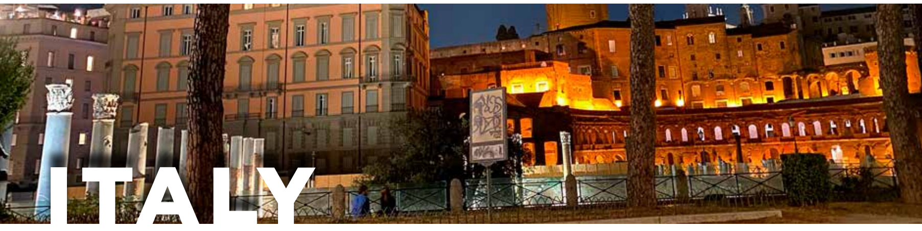
Connect with the brands looking to expand in your country! Discover 8 brands looking to open stores in Italy