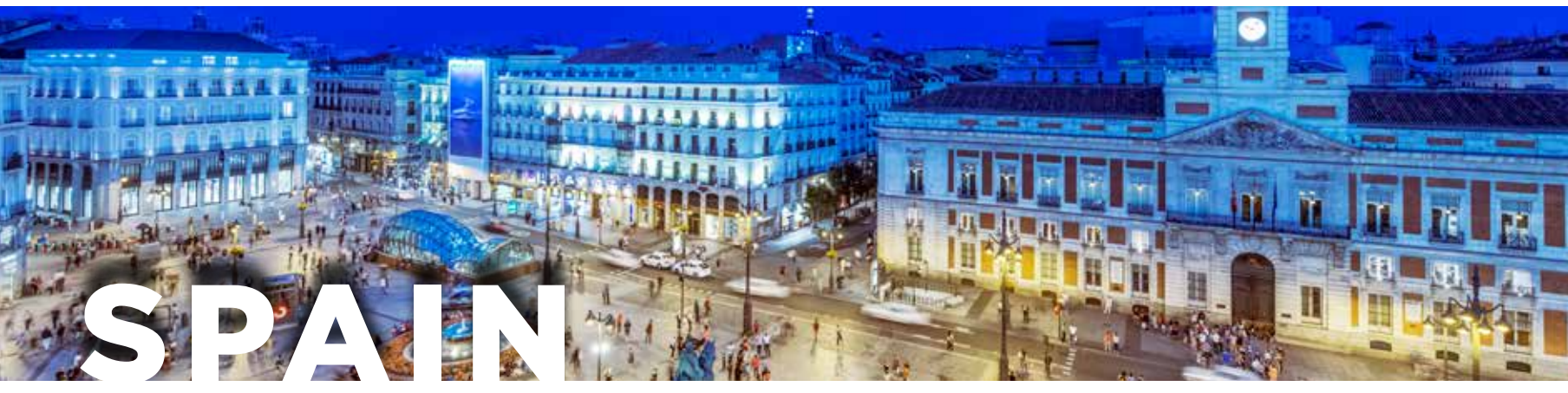
Connect with the brands looking to expand in your country! Discover 7 brands looking to open stores in Spain